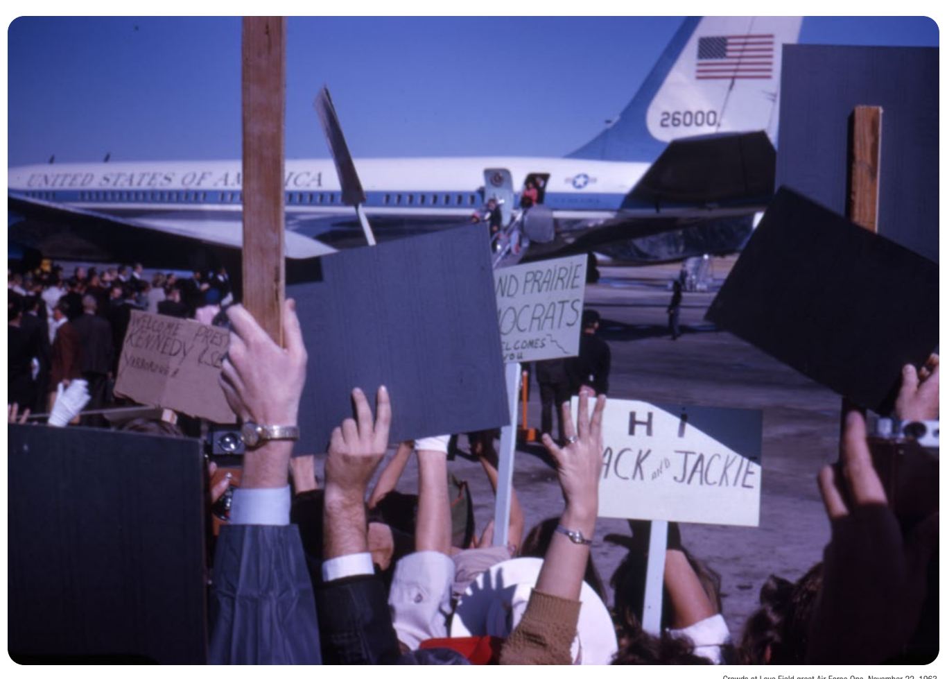
Crowds at Love Field greet Air Force One, November 22, 1963

The Museum gratefully acknowledges the following supporters of K-12 Educational Initiatives: