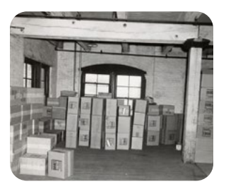
Sixth floor crime scene, Texas School Book Depository, 11/22/1963.