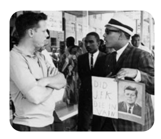
Piccadilly Cafeteria protest, Dallas, 6/5/1964.

Engage your students' detective skills to uncover time capsules created from the Museum's collection of 1960s artifacts. Learn about President Kennedy and the 1960s by examining photographs, magazines, toys, clothing and more. Students will work in groups to unpack a time capsule and discover information about the person who created it and then share their discoveries.