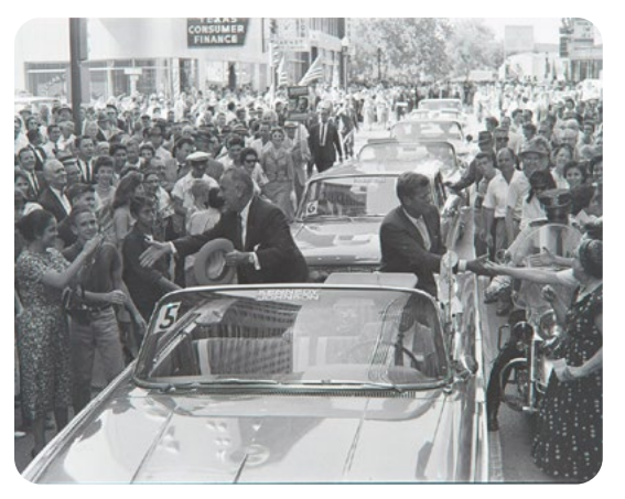
Campaigning in Texas, September 1960.