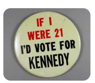
1960 Campaign Button

The presidential election of 1960 was one of the closest in United States history, with only 120,000 votes separating candidates Senator John F. Kennedy and Vice President Richard Nixon. Explore how the 1960 presidential campaign revolutionized political campaigns with a series of firsts kicking off a decade of change for the nation. Students will explore campaign materials including posters, television ads, speeches and the first televised debates while creating their own voter's guide for the 1960 election.